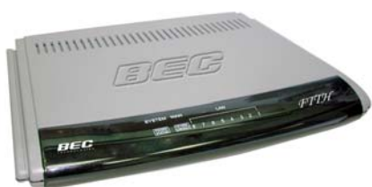
BEC FTTH Media Gateway

BEC FTTH media gateway is the most efficient, flexible, and powerful devices in its class. It provides the power and scale needed for deploying multiple IPTV services into residence. BEC's FTTH media gateway's video streaming feature offers unique features that optimize the delivery of video content to customers—including VLAN, IGMP snooping, and proxying. Service providers can deploy multiple IPTV servers without the concern of bandwidth.